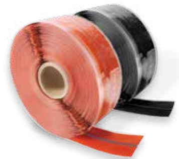
Colored guide line only on TGL (Triangular Guide Line) tapes.