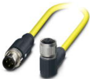
Sensor/Actuator cable, 4-position, PVC, yellow, shielded, Plug straight M12 SPEEDCON, A-coded, on Socket angled M12 SPEEDCON, A-coded, Cable length: 0.5 m

Please be informed that the data shown in this PDF Document is generated from our Online Catalog. Please find the complete data in the user's documentation. Our General Terms of Use for Downloads are valid ( http://phoenixcontact.com/download )