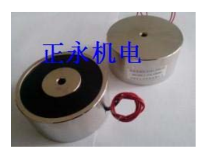
ZYE1-P Series Electro Holding Magnets

地址:浙江省乐清市柳市镇荷岙工业区 ADD: Heao Industrial Zone, Liushi Town, Yueqing City, Zhejiang China. Tel: +86-577-61761217 +86-18006686127 Fax: +86-577-61767217 www.cn-zye.com info@cn-zye.com